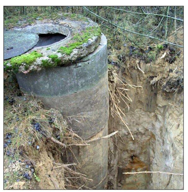
Figure 1. The photo of well's outcrop [Ignatowicz, 2011b]

The results achieved in stages I–II of the study allowed for designing the sorption barrier localized near the burial ground on a line of surface and underground waters outflow, which had to prevent from pesticide migration. The barrier design was described by Ignatowicz [2011b]. the applied study was carried out in 2009 and in 2012 in Folwarki Tylwickie village (Zabłudów commune, Podlasie province). The burial ground is localized in a direct vicinity of the cultivated field. That burial ground was classified into the 1<sup>st</sup> category of threat.